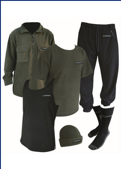
Kaiwaka summer range now Available