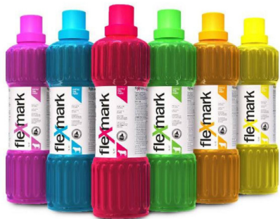
Flexmarker tail paint